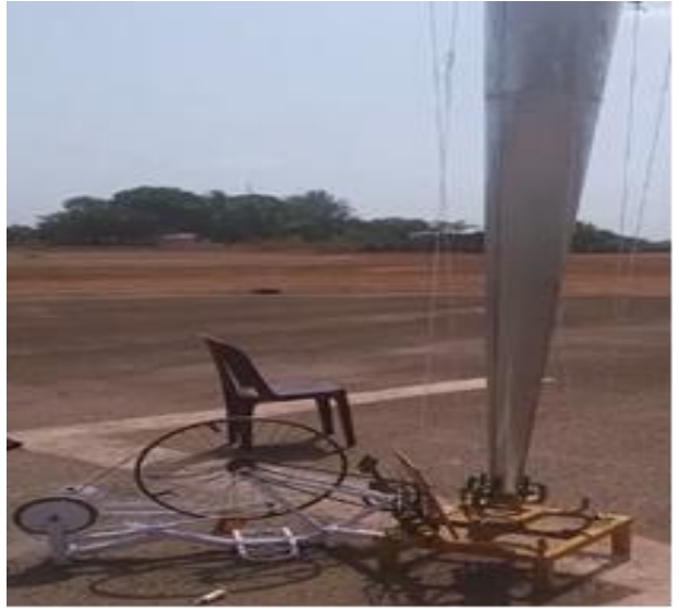
Fig. 2: Bladeless wind mill

The main principle behind bladeless wind generator is the conversion of linear oscillation of mast to rotational motion. As the mast is subjected to wind energy, it tends to oscillate due to the vortices formed around the structure of the mast, which can be converted to rotational force to generate electricity. In the bladeless wind system configuration, the mast is fixed with respect to the ground and the rib structure at the top of the mast comprising of thread arrangement is used for pulling the threads attached to it. Energy is obtained by continuously oscillation of the mast. The mast utilizes wind power to pull the threads along with the chain attached to the sprockets which drive the shaft which intern rotates the alternator to generate power. During the oscillation of the mast, the mast tries to oscillate in any direction depending on the wind direction. The rib structure at the top of the mast is attached with six threads to absorb the energy from the wind. Each set of the thread arrangement of the rib structure corresponds to one sprocket on the shaft which is driven by the chain which is pulled by the thread. Hence three sprockets are available in the shaft out of which, at least one of the sprockets is always in motion during the oscillation of the mast.